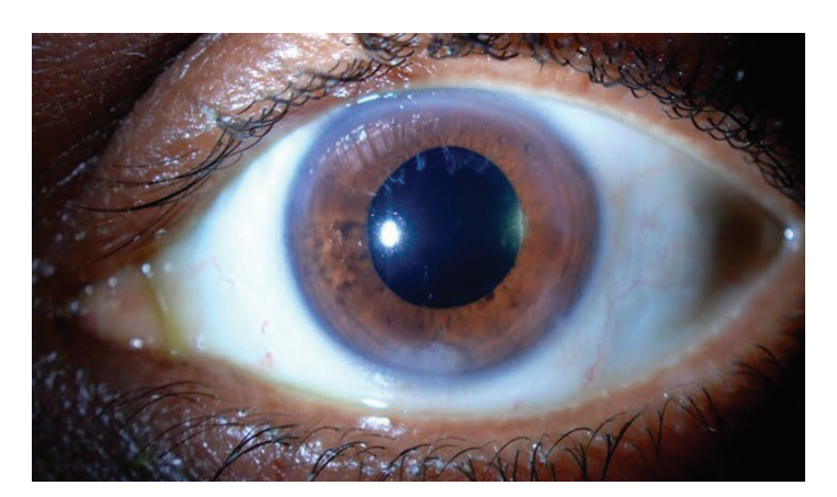
Retained Lens Fragments

A vitrectomy is outpatient surgery where the eye's vitreous gel and remaining lens material are safely removed. The eye is filled at the end of surgery with saline (salt water) solution or a gas bubble, and the operation is typically very successful.