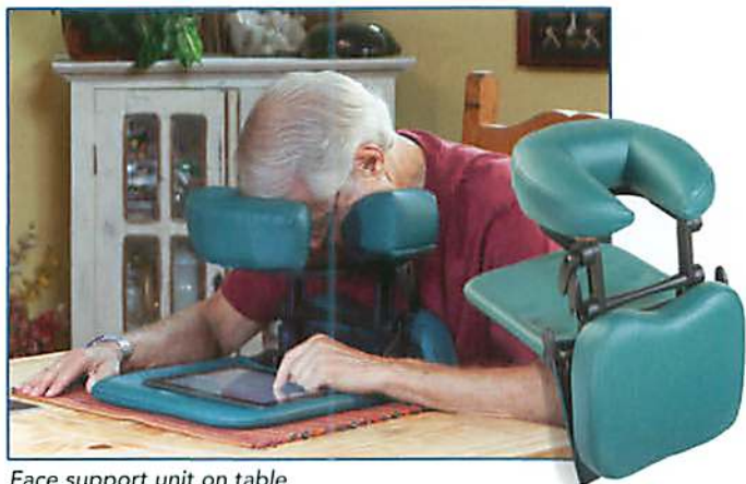
Face support unit on table

Our face support system offers two options that provide plenty of breathing room and personalized adjustability. Both options provide comfort and support and when sleeping you will be immediately aware of accidental non-compliance enabling you to promptly correct it.