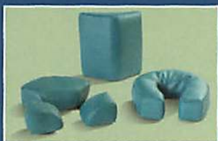
INTERCHANGEABLE MEMORY FOAM CUSHIONS