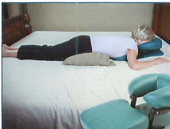
Sleep with ease