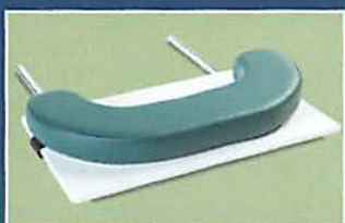
ARM REST FOR EXTRA COMFORT