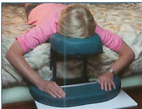
Bed top with table configuration