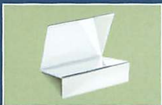
SPECIAL REVERSE MIRROR