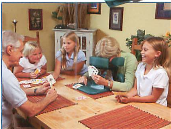
Visit with family and friends