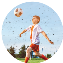
Small specks Flakes